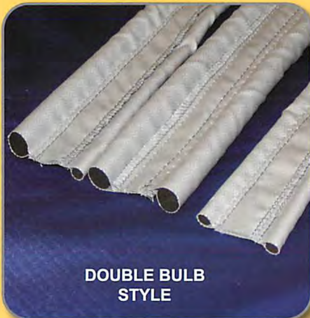
DOUBLE BULB STYLE