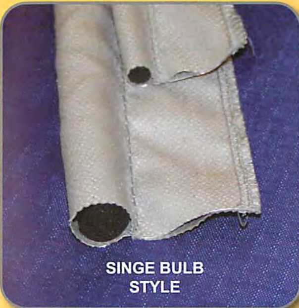
SINGE BULB STYLE