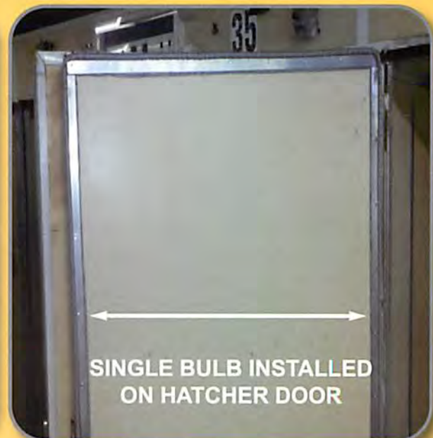
SINGLE BULB INSTALLED ON HATCHER DOOR

Glastemp Tadpole Gaskets are available in single and double bulb styles with diameters of 1/4", 3/8" & 1/2"